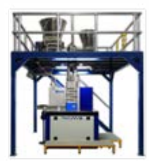
RAM 5 Continuous